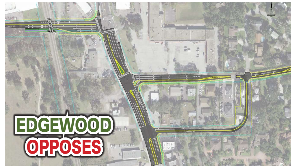
COUNTY ALTERNATIVE 3 – EDGEWOOD OPPOSES

More information is available on the City's web page.