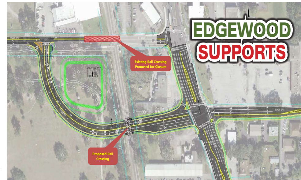
COUNTY ALTERNATIVE 1 – EDGEWOOD SUPPORTS

Yes. The realignment through the park will affect no more than two private property owners and it will not displace any residents. However, for Alternative 3, land from at least 17 privately owned parcels, mostly residential properties, will need to be acquired for right-of-way for the Lake Gatlin Road extension to Gatlin Avenue. This alternative will also result in the displacement of multiple residents and businesses, increasing the costs dramatically.