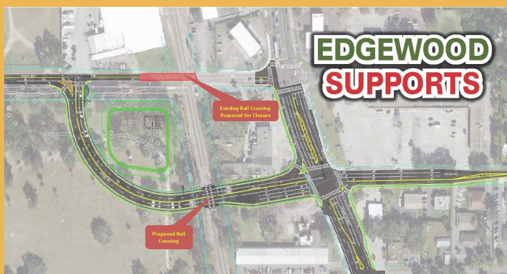
COUNTY ALTERNATIVE 1 EDGEWOOD SUPPORTS

Oak Ridge High School Auditorium, 700 W Oak Ridge Rd.