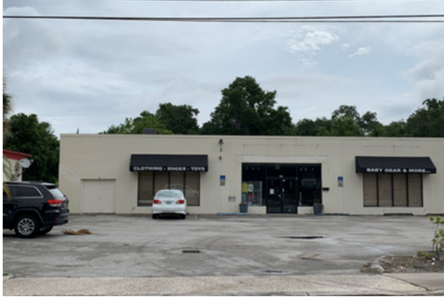
Before: 5151 S. Orange Ave.