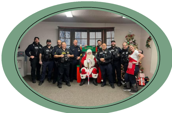
Santa and Edgewood PD celebrate another successful event.