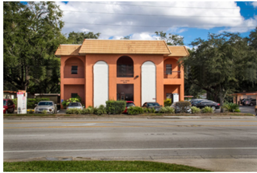
Before: 5205 S. Orange Ave

Edgewood's vibrancy is driven by the dedication of its residents and businesses. I would like to recognize two exemplary properties on Orange Avenue for the Edgewood Beautification Award. The Edgewood Beautification Award encourages residents and businesses to invest in their properties and contribute to our city's aesthetic. By recognizing outstanding efforts, we inspire continued improvement.