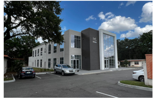
After: 5205 S. Orange Ave