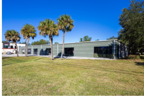
After: 5151 S. Orange Ave

The impact of well-maintained properties extends beyond mere aesthetics. Studies consistently show that attractive neighborhoods and business districts have a positive influence on property values. This ripple effect benefits all residents, contributing to a stronger, more vibrant community.